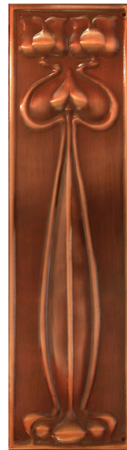
Duchess fingerplate (above) with Special Antique Effect on Copper. Effect conveys a medium aged appearance, and retains the rich, warm overall tones of deep copper.